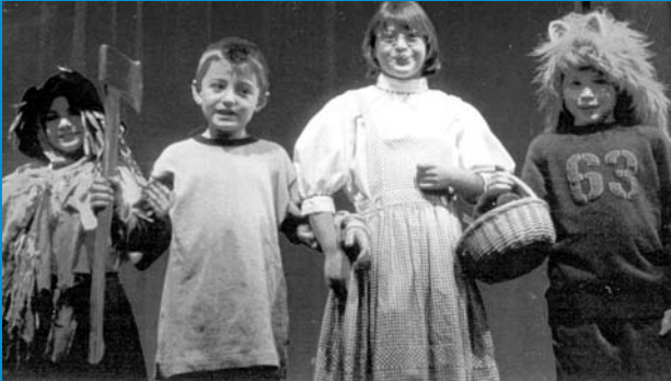
Some of the children who performed in "Hooray for Hollywood"

Classes for students of all ages and abilities allow students to sharpen their communication skills and find new ways to express themselves.