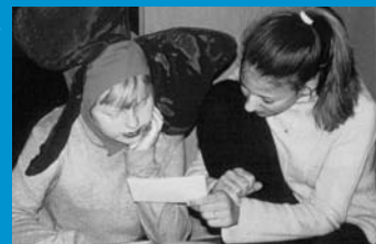
A peer mentor helps a student rehearse her lines for "A Brand New Day," SGT's first musical in 2001.

A unique component of SGT, the Peer Mentor Program consists of matching typically developing peers with an SGT student throughout our program. The mentors volunteer their time to work with our students (one-on-one) in the classroom through rehearsals and appear on stage as part of the ensemble in our final production. This program has proven to extend beyond the walls of SGT, as friendships, understanding and respect grow on a daily basis.